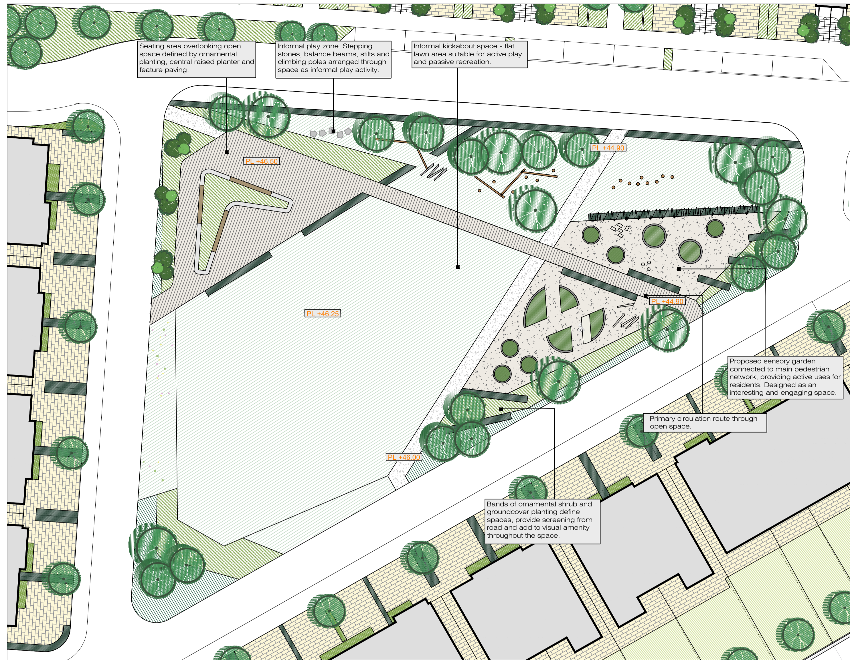
Open Space 2 | 1:250